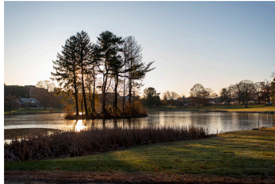
Sunset on Mirror Lake

In order to reduce the risk of transmission of COVID-19 (coronavirus), professional Residential Life staff are working standard hours on a hybrid schedule rotating between the office and telecommuting. Voicemail boxes will be checked regularly while staff work remotely or telecommute, but we strongly encourage sharing any questions for staff either at their UConn emails or to submit general questions to livingoncampus@uconn.edu .