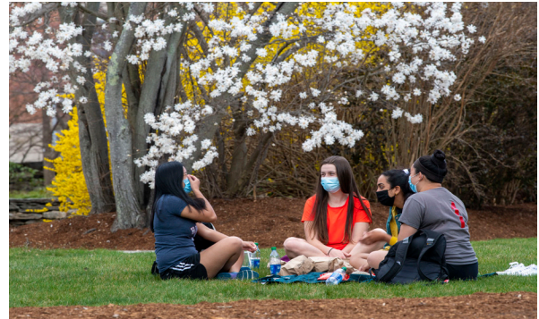
Students studying and socializing outside together during the spring semester