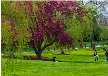
Campus trees in full bloom

https://reslife.uconn.edu/residential-life-cancellation-policy/